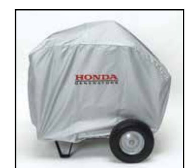
Universal Folding Handle Cover