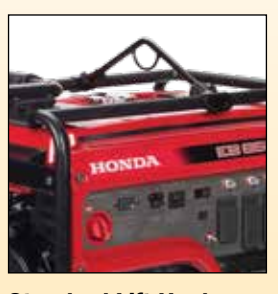
Standard Lift Hooks EB5000X, EB6500X, and EB10000 models come standard with lift hooks for added jobsite security.

GFCI and Neutral Bond Honda EB Industrial Series generators are OSHA compliant with neutral bond and full generator GFCI (Ground Fault Circuit Interrupter) circuit protection on all receptacles.