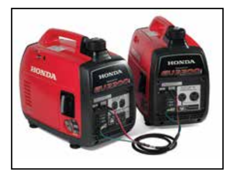
Parallel Cables for connecting two identical EU series generators.