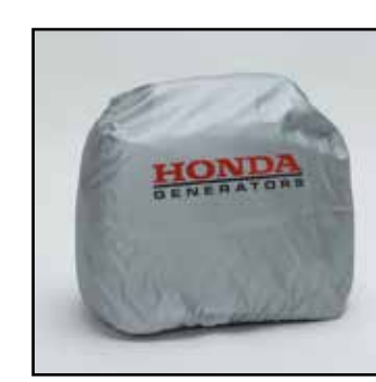
EU Storage Cover Silver