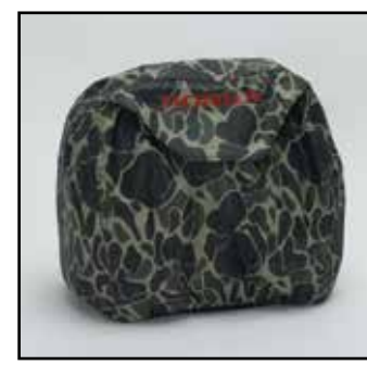
EU Storage Cover Camo