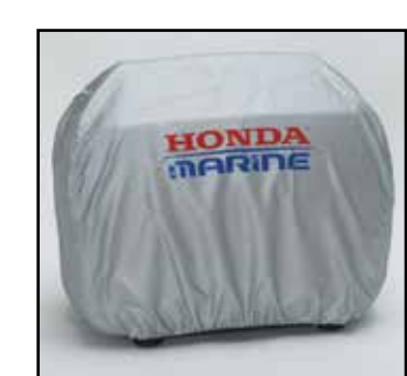
EU Storage Cover Marine Silver