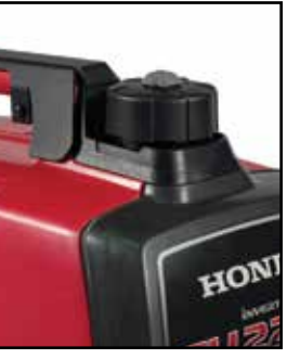
EU2200 i Theft Deterrent Bracket Steel bracket with tamper-proof bolts deters thieves from cutting the plastic handle and removing a cable lock.