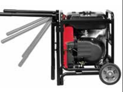
EB2800i & EG2800i 2-Wheel Kit with folding handles.