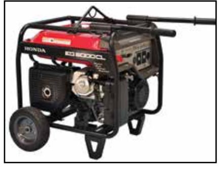
Wheel & Handle Kit, Hanger Kit (Large EG Series)