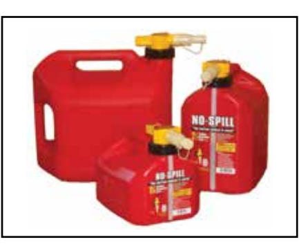
No-Spill<sup>®</sup> Gas Can