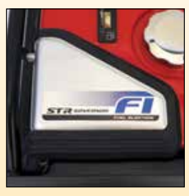
Fuel Injection Honda's EU Series flagship EU7000is features modern fuel injection, providing reliable power without fuelrelated problems.