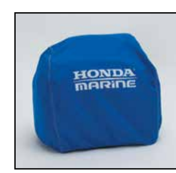
EU Storage Cover Marine Blue