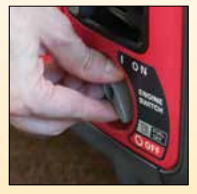
Fuel On/Off Switch All 2200-watt models feature a fuel shutoff valve which helps minimize stale fuel issues and makes storing and transporting your generator easier.