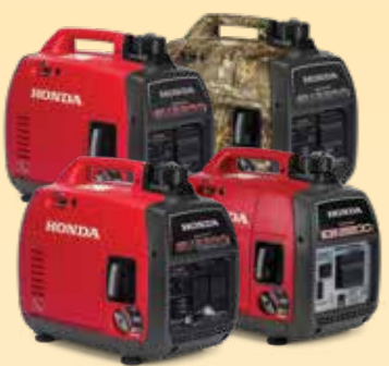
EU2200i - Super Quiet Series EU2200/ Camo - Super Quiet Series EU2200/ Companion - Super Quiet Series EB2200i - Industrial Series