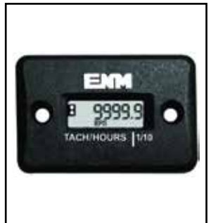
ENM Hour Meter monitors usage time for proper maintenance scheduling.