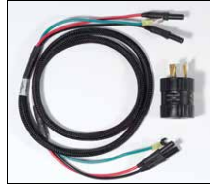
EU2200 i Companion Parallel Kit for combining an EU2200i to an EU2200i Companion generator to double the power. Includes RV cord adapter.