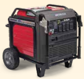
EU7000is - Super Quiet Series