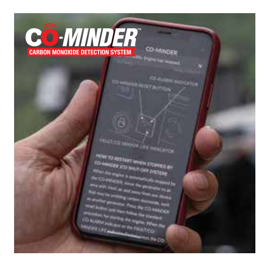
My Generator smartphone app includes alerts and instructions if your Honda Generator is automatically shut down by the CO-MINDER™ Carbon Monoxide Detection System.