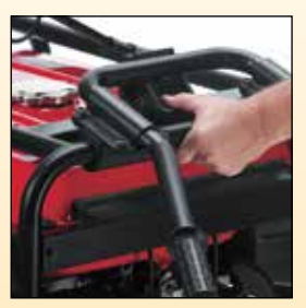
Folding handles Honda EB5000X and EB6500X models feature a unique push button folding handle system that offers a smaller overall footprint for convenient transport and storage.