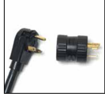
RV Adapter Plug