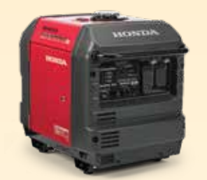
EU3000/s - Super Quiet Series