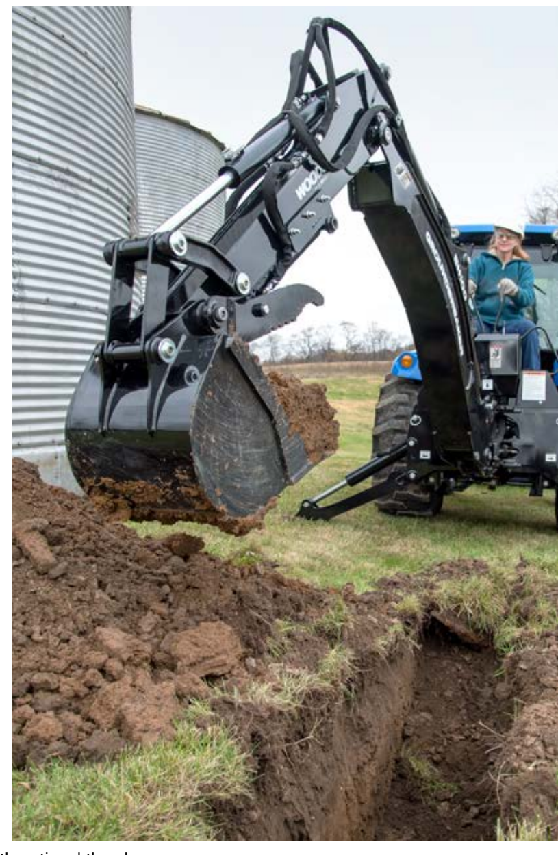
BH100 shown with optional thumb