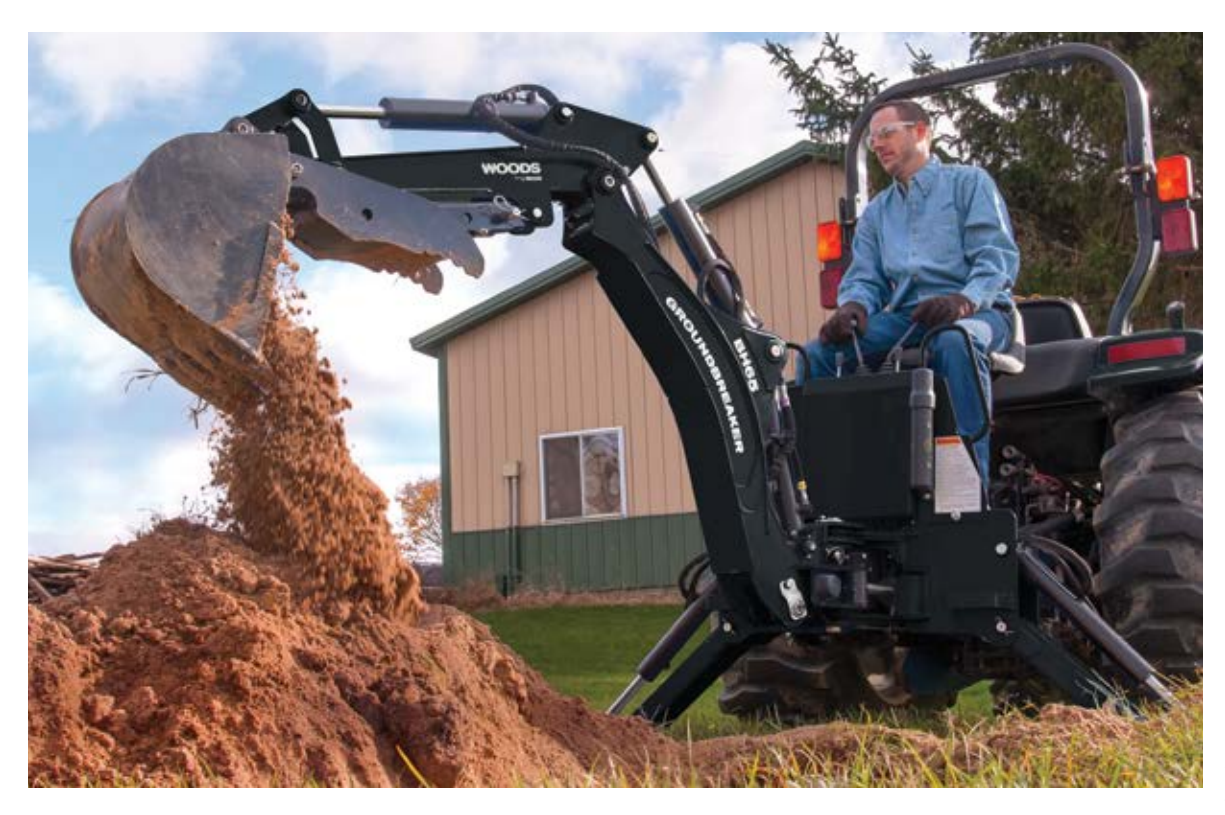
BH65 shown with optional thumb