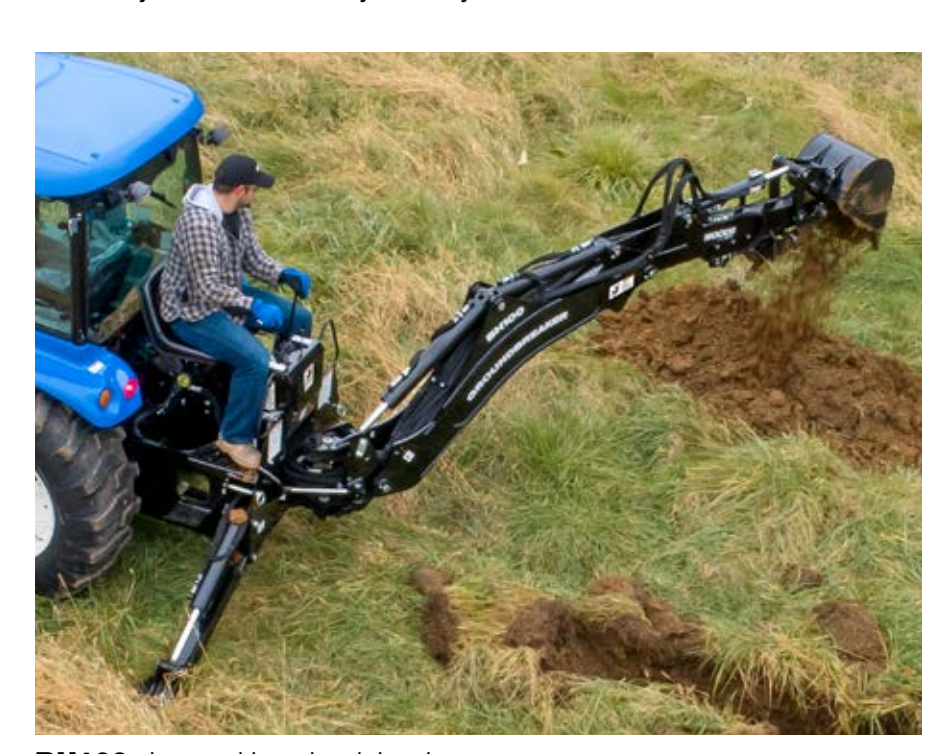
BH100 shown with optional thumb