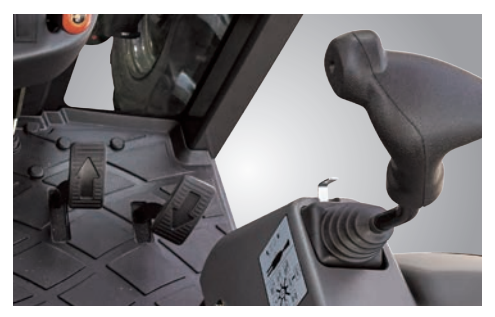
Single Lever Joystick

The easily accessible differential lock lever allows for engagement/disengagement of the differential allowing you to maintain traction on uneven or muddy terrain.