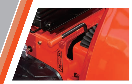
4WD Engagement The 4WD comes standard on all models and is engaged with an easy access lever.