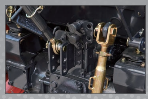
Remote Hydraulic Valves A standard single remote valve (2nd optional) accommodates a wide variety of attachments and implements.