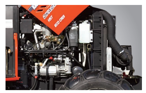
Eco-Friendly Diesel Engine

DK10SE Series models feature a performance proven, heavy-duty HST drive delivering power and efficiency. The three range transmission (Hi/Mid/Low) with twin pedal operation makes your job easier, smoother and safer.