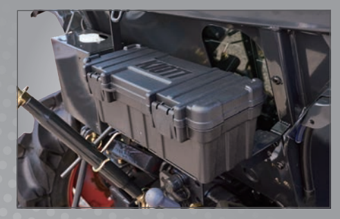
Tool Box Conveniently located behind the seat, this tool box provides storage the operator needs.