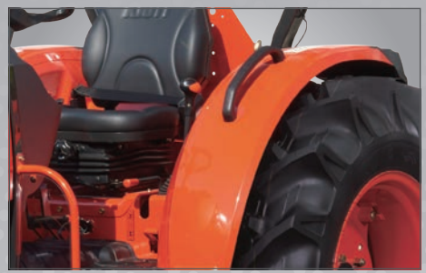
Fender Grip Available on each side of ROPS model tractors, these handles provide assistance while getting on and off of the tractor.

Self supported with an air cylinder, the single piece hood enables quick and convenient access for daily maintenance.