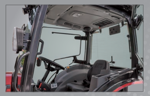
Advanced Air Conditioning System DK10SE cab models come standard with a cooling and heating system ensuring comfortable working conditions all year round.