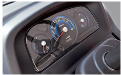
Illuminated Dashboard The illuminated dashboard ensures great visibility while working in all lighting conditions.