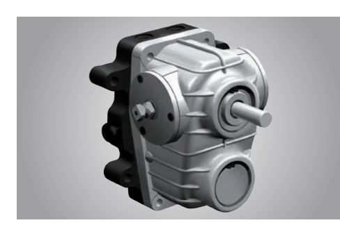
Powerful HST Transmission

With one touch, engine speed may be set to maintain steady rpm to maximize working efficiency. When engaged, the operator may change the engine rpm by simply pressing a switch to increase or decrease the rpm.